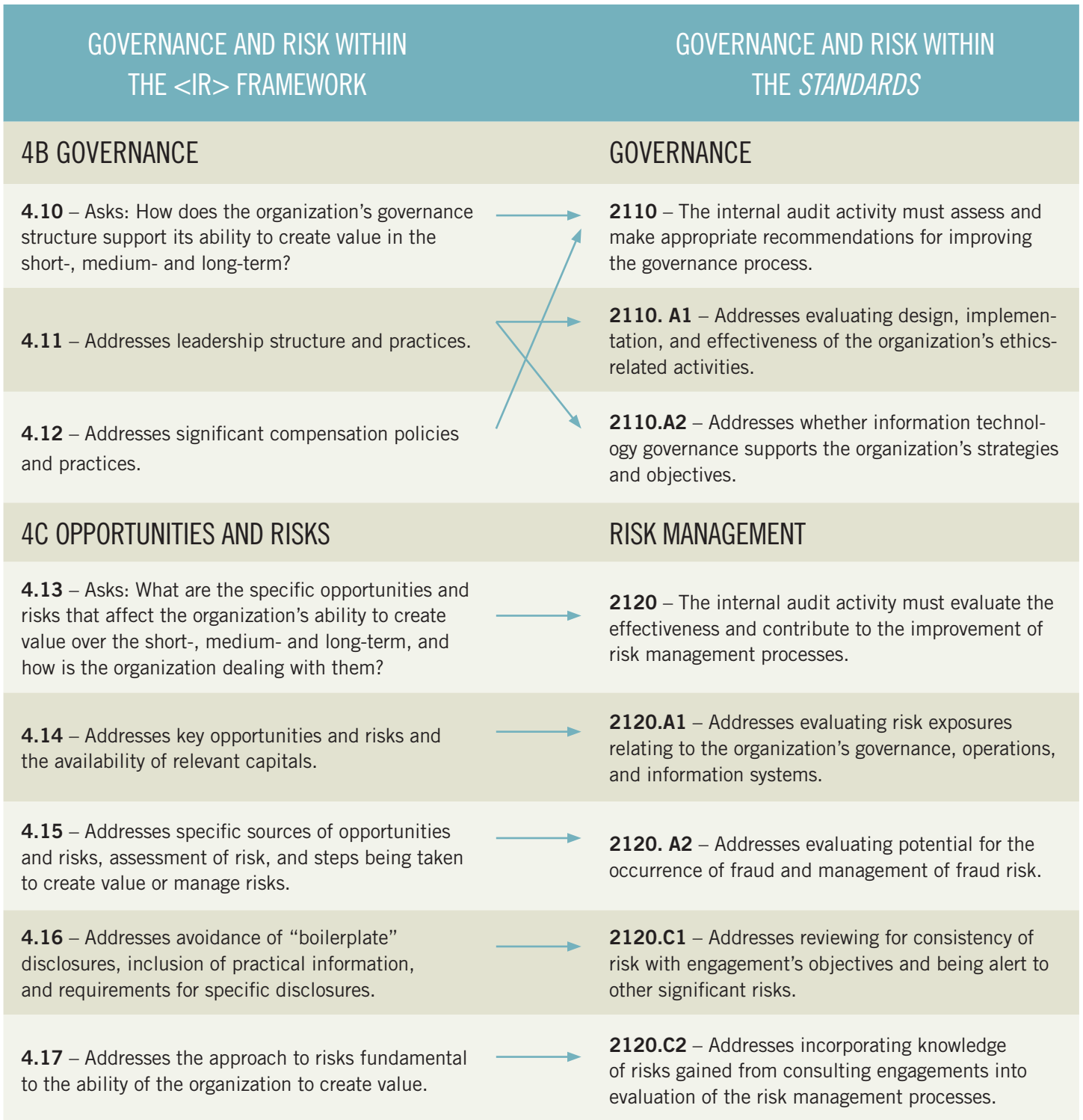
This chart maps sections 4B and 4C of the proposed <IR> Framework to Standards 2110 and 2120. Conformance to the governance and risk management elements of Standard 2100 allows internal audit to meet current objectives while helping prepare for the move toward integrated reporting.